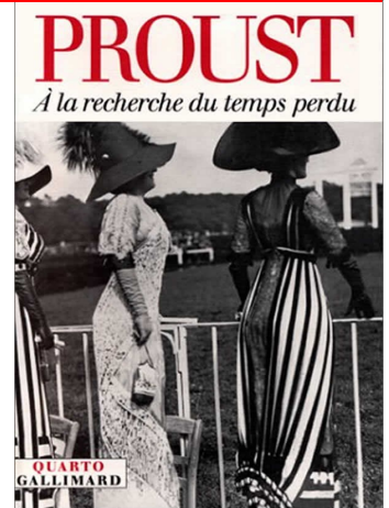
Cover of Gallimard edition of Proust's book