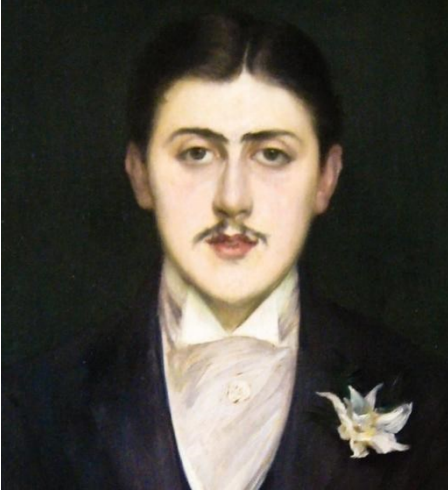
Marcel Proust Portrait by Jacques-Emile Blanche, 1892

An evening program of musical performances, accompanied by readings of Marcel Proust's book, In Search of Lost Time , in sponsorship with the Alliance Francaise of Greenwich and the Proust Society of Greenwich.