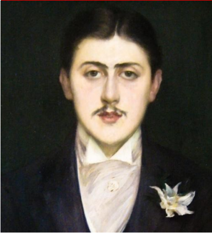
Marcel Proust Portrait by Jacques-Emile Blanche, 1892